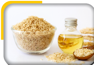
Rice Bran Fatty Acid