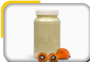
Palm Fatty Acid