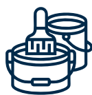
Paints & Inks