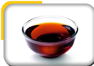
Distilled Coconut Fatty Acid