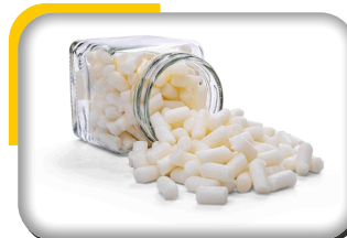
Soap Noodles All Grades