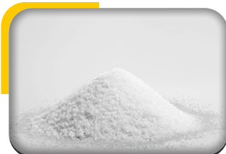
Hydrogenated Palm Stearin