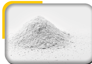
Hydrogenated Technical Oil (HTO)