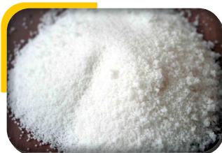
Stearic Acid (All Grades)